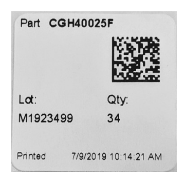
Figure 2 – Label on the individually bagged trays or reels.

Tray and Reel labels (Figure 2) include a bar code. The bar code is in the format: %$<part>$<lot>$Q<qty$%. For the example label below, the read-out is %$CGH40025F$M1923499$Q34$%